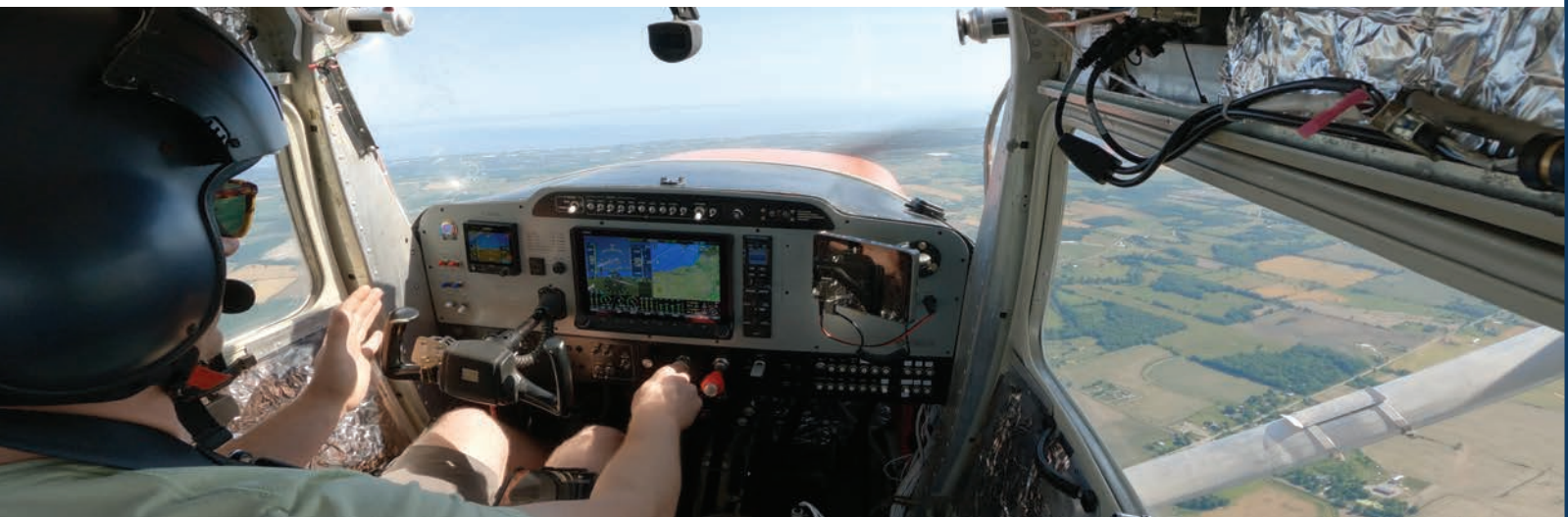
Ribbit flight testing their autonomous autopilot system.

—Marko Ilievski, staff robotics engineer at Ribbit